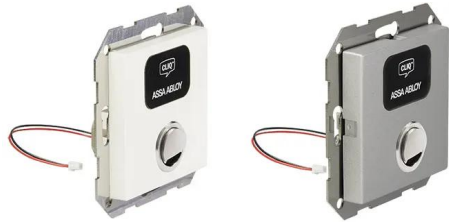
AUS2 = GIRA REINWEISS / ALU